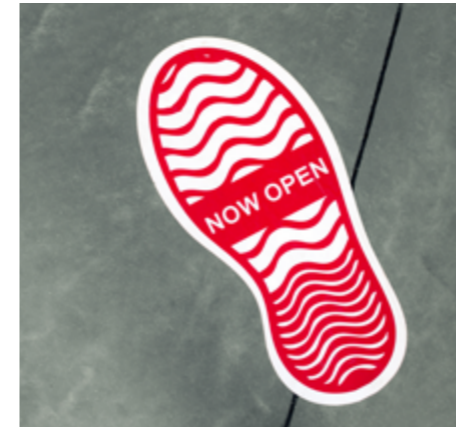
filmolux® easy clear sand